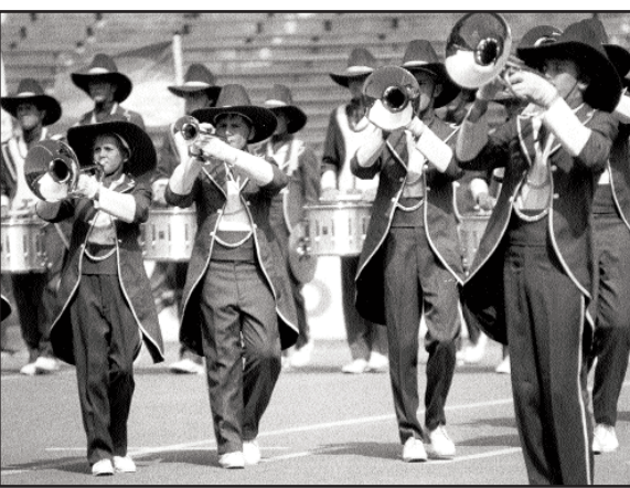
Railmen, 1985, at the DCI Championships in Madison, WI (photo by Donald Mathis from the collection of Drum Corps World).

With the exception of a couple of out-of-town performances, the corps performed only at local functions. Although buses were chartered to transport members, the trip to Wyoming was made in railroad