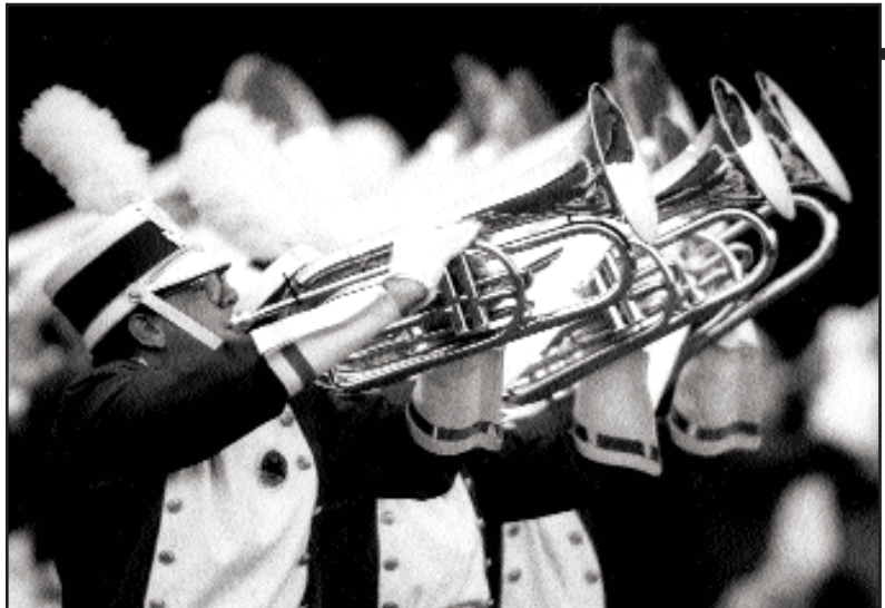
Railmen, July 22, 1991 (photo by Orlin Wagner from the collection of Drum Corps World).

points higher than the corps had ever achieved.