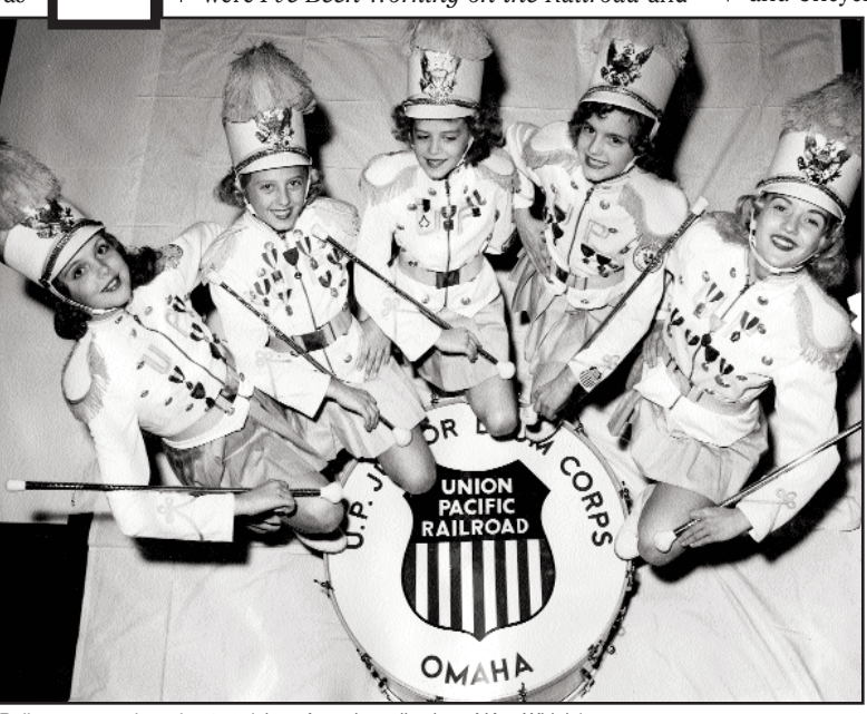
Railmen, approximately 1950.

The first two numbers the corps played were I've Been Working on the Railroad and