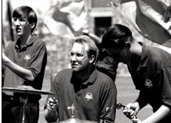
Railmen, 1994, the one year the corps competed as a senior at the DCM Championships in De Kalb, IL.